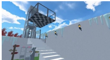
Figure 2. Examples of clues in the sky visible from the passageway of the maze (left side) and items placed in the passageway of the maze (right side)